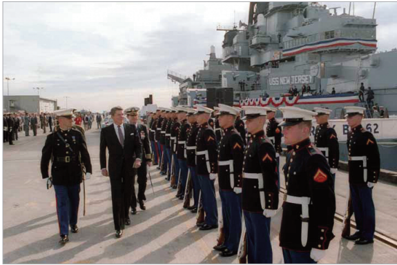
► What was the idea of “peace through strength?”

the Cold War . Both sides built up their militaries. Each side tried to gain the advantage. Both countries had many nuclear weapons . This created a dangerous situation in the world. People did not feel safe. They felt that war could break out at any minute.