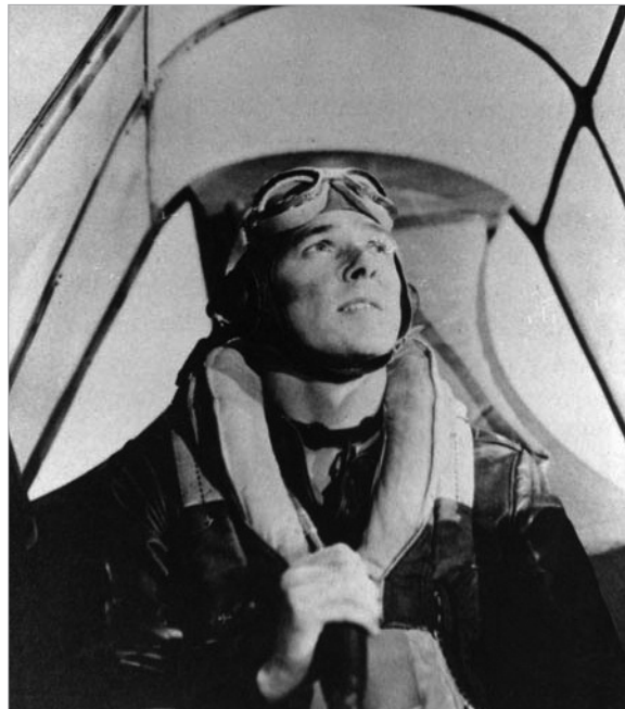
► How did Ronald Reagan serve his country during World War II?

Among his many interests, Ronald Reagan enjoyed acting most of all and hoped someday to have a career in the movies.