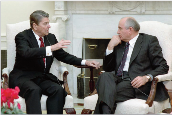
► How did Ronald Reagan and Mikhail Gorbachev work together to reduce the risk of war?

People who tried were arrested and sent to prison.